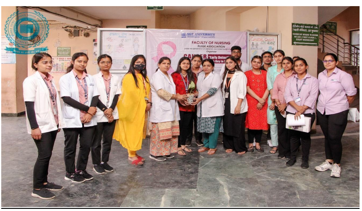
Felicitation to Chief Matron, CIVIL Hospital