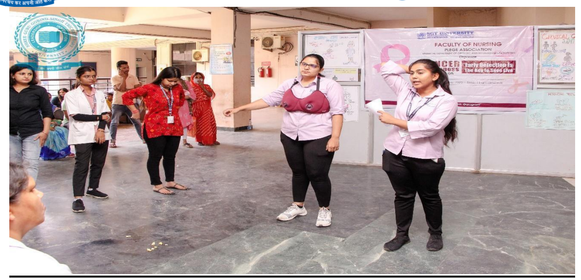
M.Sc. Nursing students explaining Steps of Breast Self –Examination