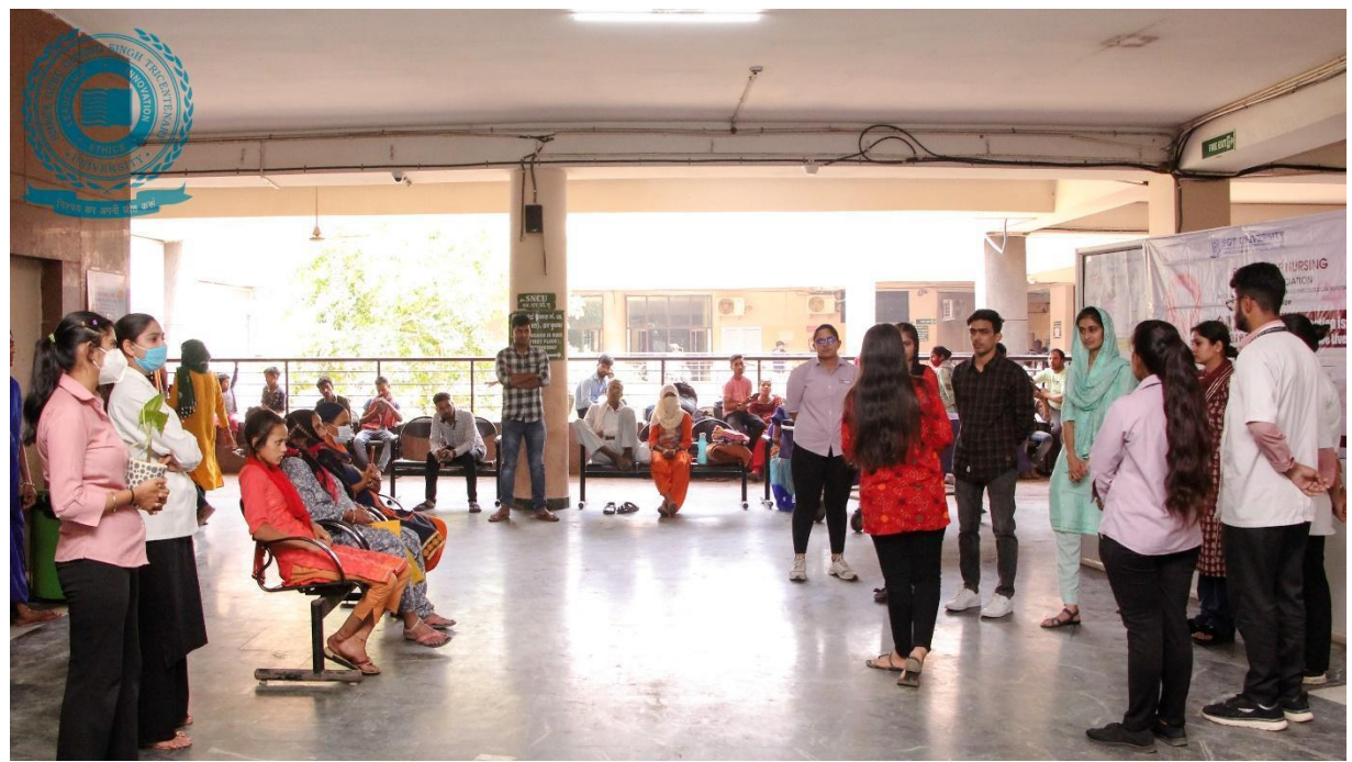
Role play by 4<sup>th</sup> year B.Sc. Nursing students on Cancer awareness