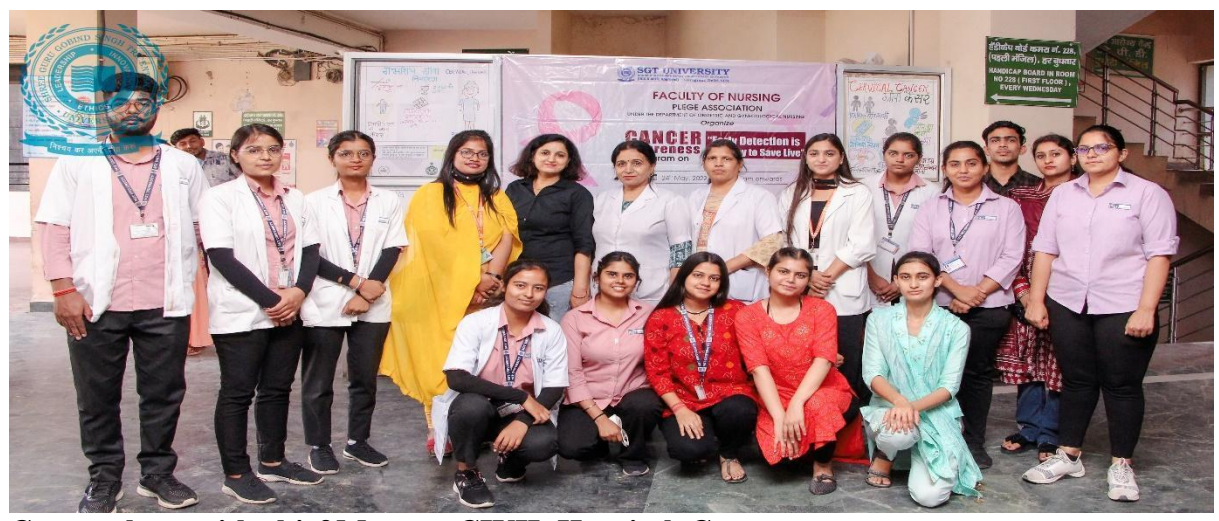
Group photo with chief Matron, CIVIL Hospital, Gurugram